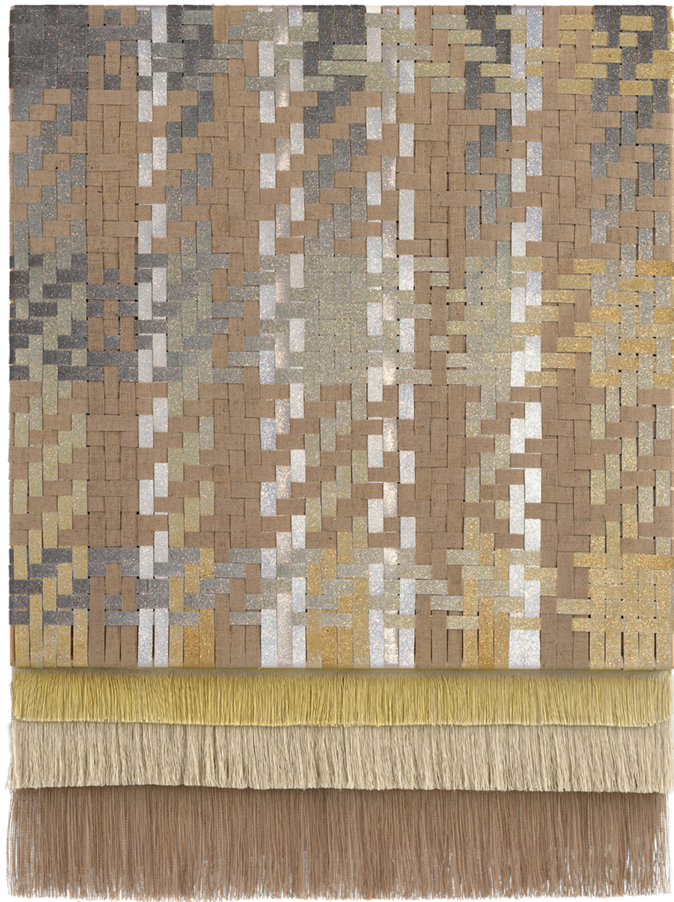
Interconnected Metal flake and automotive paint on canvas and raw hessian, woven reconstruction, with turmeric dyed frill 90 x 120cm 2025