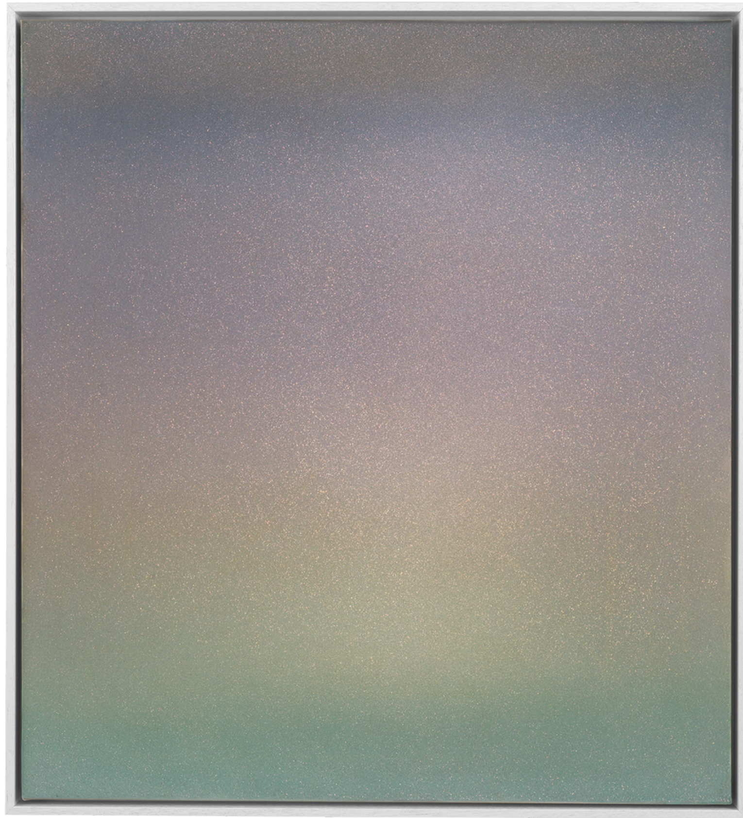
Silver linings Metal flake and automotive paint on canvas with wooden frame 102 x 112cm 2025