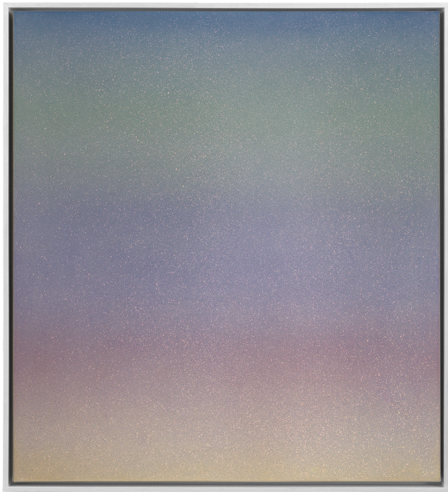
Levels of my soul Metal flake and automotive paint on canvas with wooden frame 102 x 112cm 2025