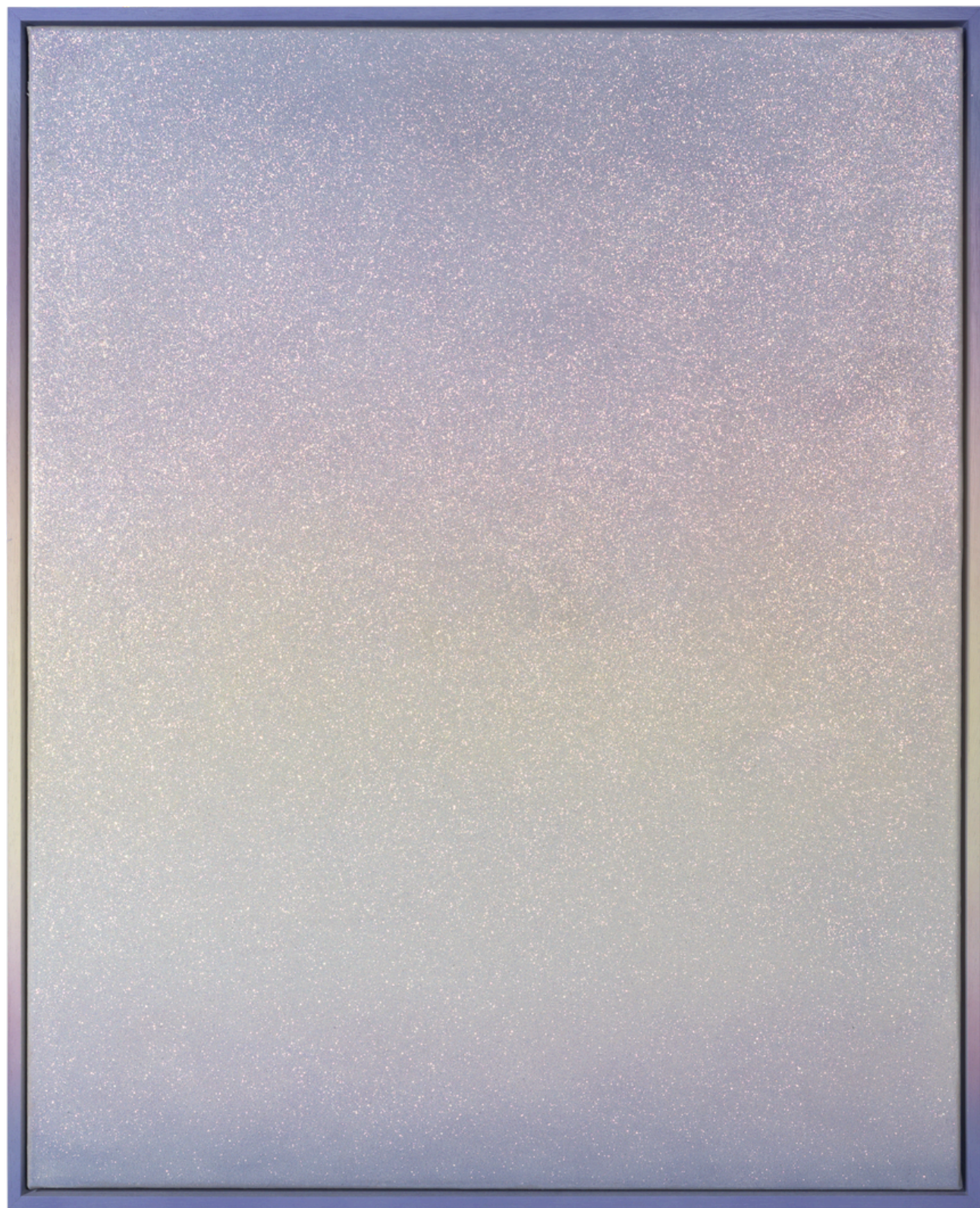
Revelation Metal flake and automotive paint on canvas With hand sprayed wooden frame 82 x 102 cm 2025